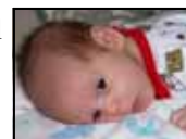
Balding at an early age—one month (Aug '03)

They jump, run, hide, and play for endless hours—the innocence of childhood. We are so blessed to have them.