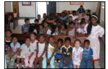
Children's Church Weekly Gatherings

With the political and social climate all around her becoming filled with animosity toward religion in general, and Venezuela's schools churn out young minds filled with Communist/Socialist anti-American doctrines, the believers are faithfully