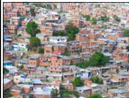
Cross-section of the "concrete jungle" world of the barrios (slums)

It is a sad time of departure for us as we think over the memories of seeds sown in many hearts among these people, mingled with the hope that we will soon be reunited with them to carry on the work. We believe the Lord will use our forced physical separation from them as a means to