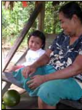
Little Naso Indian girl attending meeting in Solong village

This August Bro. Akers and I went into the Naso territory to conduct extensive services in several key villages. The Lord really did move upon