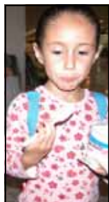
Int’l Traveler--airport in 2005