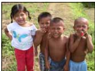
Meet the village of Bonjik welcoming brigade and constant companions

the hearts of the Naso Indians. Days were spent surveying the area and making contact with the Indians, (and scratching mosquito bites). Evenings passed in a flash with teaching and evangelistic services, (while buzzing off bats and scratching more mosquito bites). In one village, several adults made a public profession of faith in Christ, and united