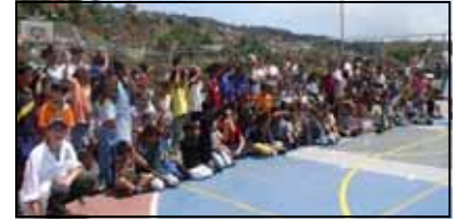
Children's Outdoor Crusade

The mother church in Barrio Santa Ana is doing well. Throughout 2004 we worked together with the nationals extending the ministry outreach, adding two