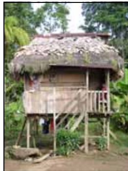
Typical Naso Indian home-built on stilts with a palm leaf roof

We are now focused on establishing a permanent base in the central area among the Naso Indians, and are working towards further evangelization of the tribe and church-planting. We plan to spend 2006 making several trips into the region in order to further this work.