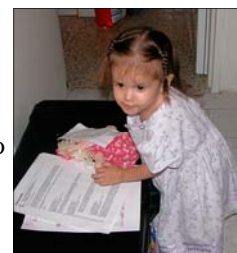
Dad's little secretary, shuffling my papers.

fervently and sing to her heart's content in worship to the Lord. Perhaps, her favorite thing to do is eat, and eat, and eat, and eat,