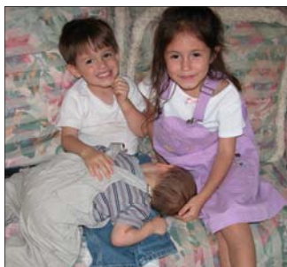
Ministering to baby brother

praising the Lord. He remains a bit shy, and has the energy of the rest of us combined. He loves church and especially street preaching services. Overall, he's a very sweet boy who we love very much and are grateful to train him