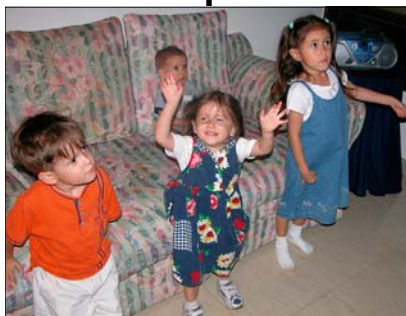
The children trying to master the movements in the song "Father Abraham", right hand, left hand...