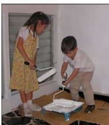
Painting for Jesus