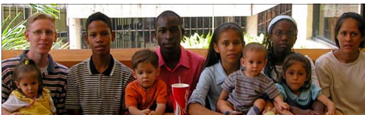
Our family with four of our youth that have made a real commitment to the Lord. We spend extra time with the saved teens to train them in their Christian walk and encourage them in the Faith. The two boys in this photo have starting preaching.

Please pray for each one, that God will help them to become grounded in their faith and bold in their testimony.