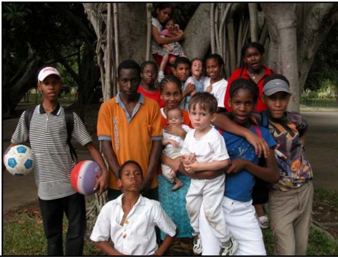
A photo of our first field trip to East Park, where we had a full day of activities and fun with 12 of our teens.

“Más que Vencedores” ( More than Conquerors ) is the name of our youth outreach. Within the last few months, this ministry has doubled in size from 7 young people to the present number of 14. The young people are returning week after week to our Wednesday night meetings to learn about the Lord and be disciplined in the Christian life. We’ve seen some exciting results, forged new friendships and learned much about the struggles of being a teen in the crime-infested, sin-laden culture of the slums. We continue to see young people getting saved through this outreach—and that is exciting!!!