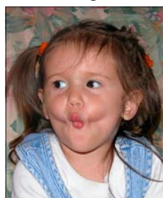
This kiss is a little fishy