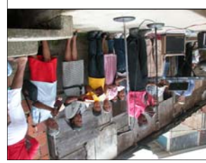
Recent street service in the slums of Caracas.